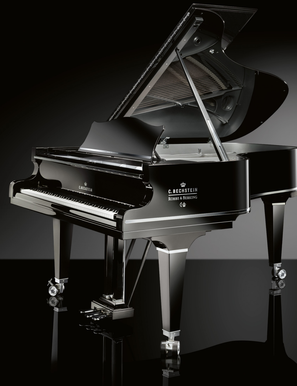
B 212 Sterling